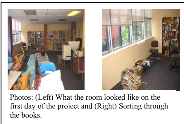
Photos: (Left) What the room looked like on the first day of the project and (Right) Sorting through the books.