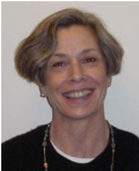
Here in the SF Bay Region ...

Hello, everyone. It's a pleasure and an honor to serve this great Chapter. The 2003-04 year officially got under way in late June. Here's some of what's been going on: