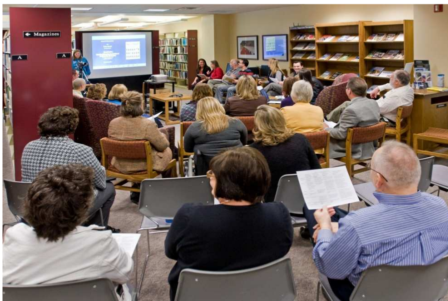
Mn/DOT Commissioner Sorel leads a book discussion in the library.