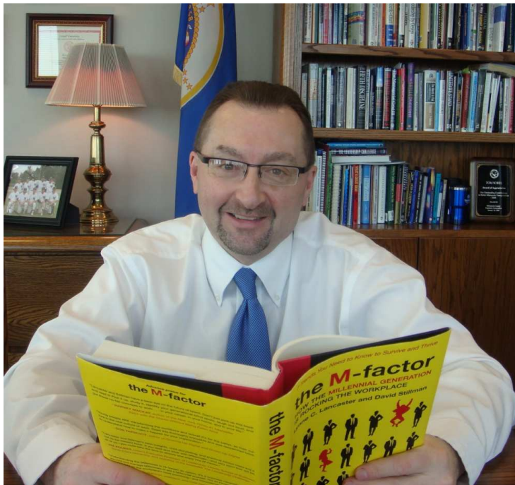
Mn/DOT Commissioner Sorel being interviewed for the book "The M-factor: How the Millennial Generation is Rocking the Workplace."

To see a list of the Commissioner's Reading Corner books, visit www.goodreads.com/review/list/2944786 . To read interviews with the book discussion leaders, visit onmymind.areavoices.com/category/crc-book-interview/ .