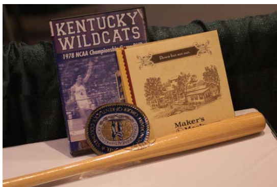
Some Kentucky KYSLA Swag

The Kentucky chapter is special and if you don't believe it, attend an SLA annual conference or the upcoming Leadership Summit in January. I can't tell you how many times people asked if they could be "honorary" Kentucky chapter members or say they knew someone in the chapter. Several times people asked if we were going out for dinner and could they join us? It was evident that wherever Kentucky Chapter might be, that was the place to be!