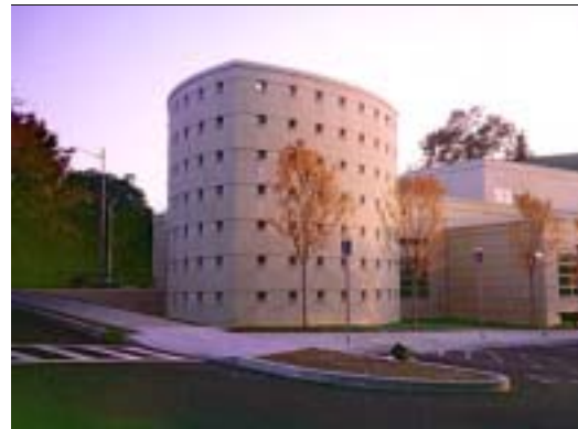
The Jewel, a room for study and meditation, is located on the East end of the Library.