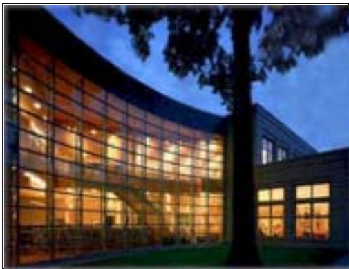
An outside view of the Peterson Wing at the Greenwich Library.

If you haven't had a chance to visit the Greenwich Library, please do. I guarantee, you'll be enthralled.