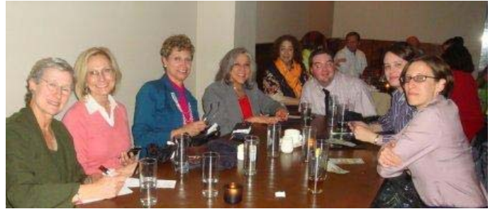
Sonoma Restaurant and Wine Bar, November 10th