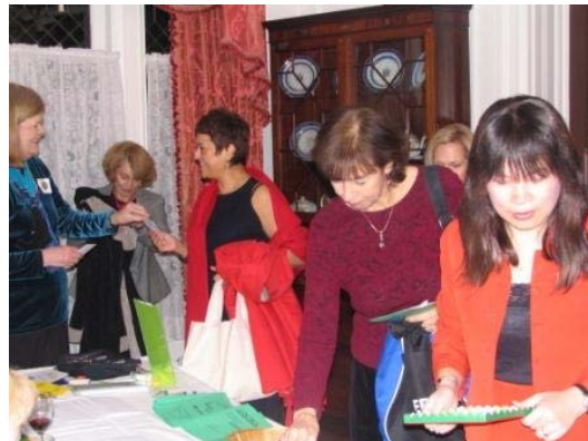
Chapter members check in at the Annual Meeting and Banquet