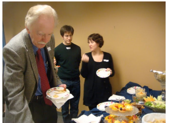
Networking Session