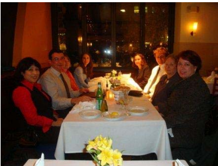
Levantes on October 15th