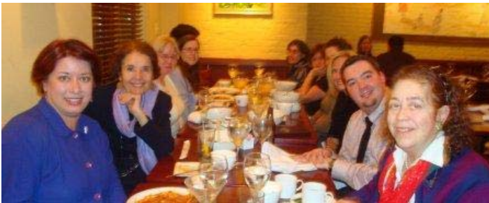
Mandu Korean Restaurant, October 13th