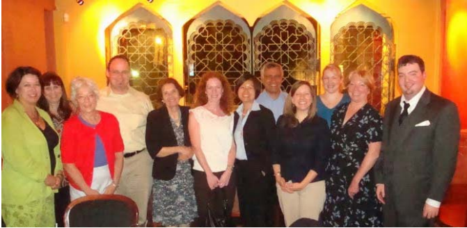
Mama Ayesha's Restaurant, September 10th

This fall, DC/SLA members gathered once again for casual get-togethers at area restaurants. Watch for another round of dine-arounds this spring!