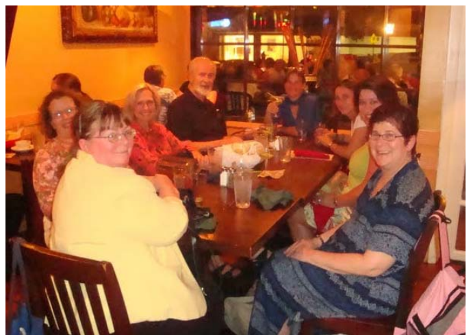
Guapo's Mexican Restaurant in Tenleytown.