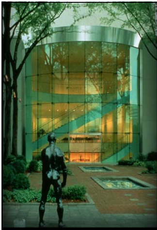
Birmingham Museum of Art