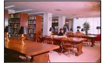
Clarence B. Hanson, Jr. Library at the Birmingham Museum of Art

The Clarence B. Hanson, Jr. Library supports this collection with 20,000 noncirculating volumes on art, art